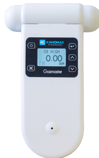
Gasmaster Handheld Gas Monitor